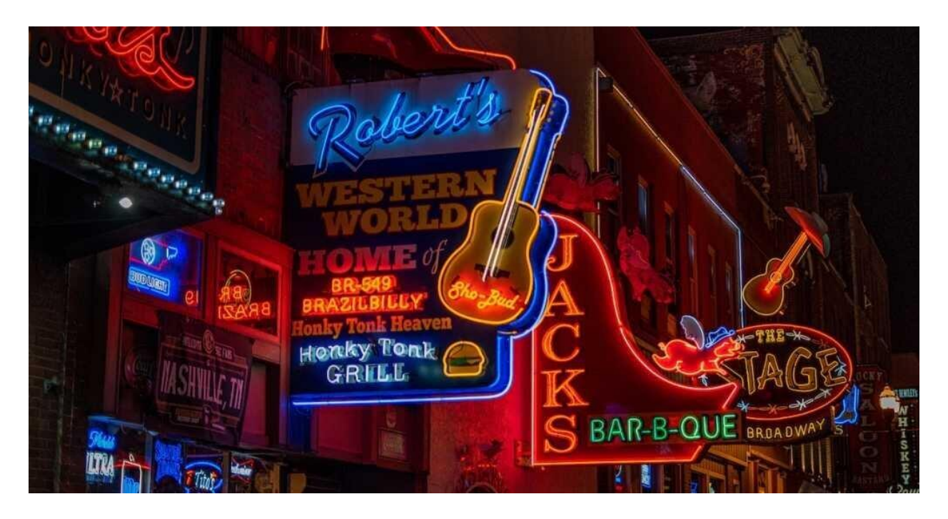
Nashville Job Market